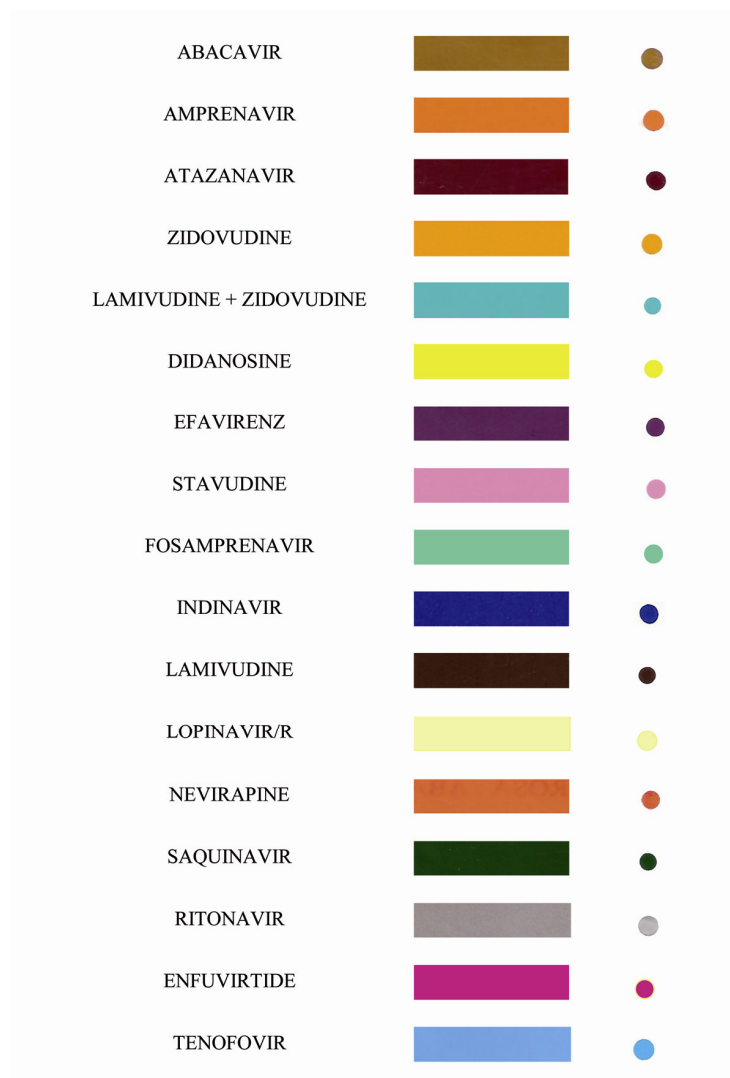
Figure 3. Description of antiretroviral's colors

5 th - The importance of treatment and adherence will be reinforced.