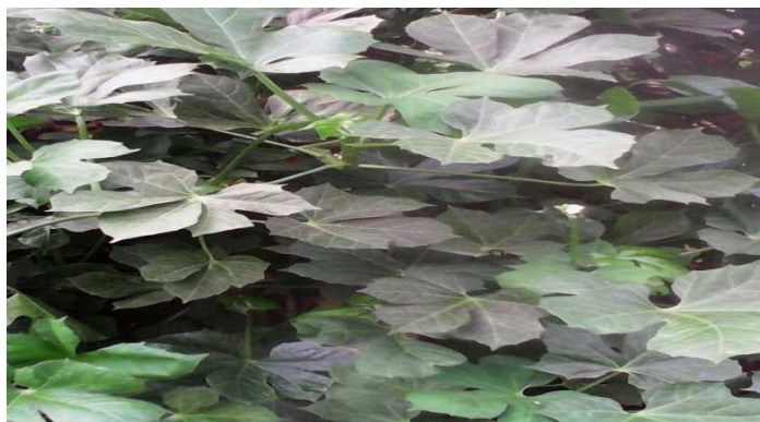
Figure 1. Chaya plant ( Cnidoscolus chayamansa )

Kaduna. Chaya leaves were harvested thoroughly washed with clean water and were chopped to approximately 2-3 cm sizes. The sample of the chopped leaves was divided into two parts; the first part was shade dried at room temperature for three days and label as raw dried sample (RDS).