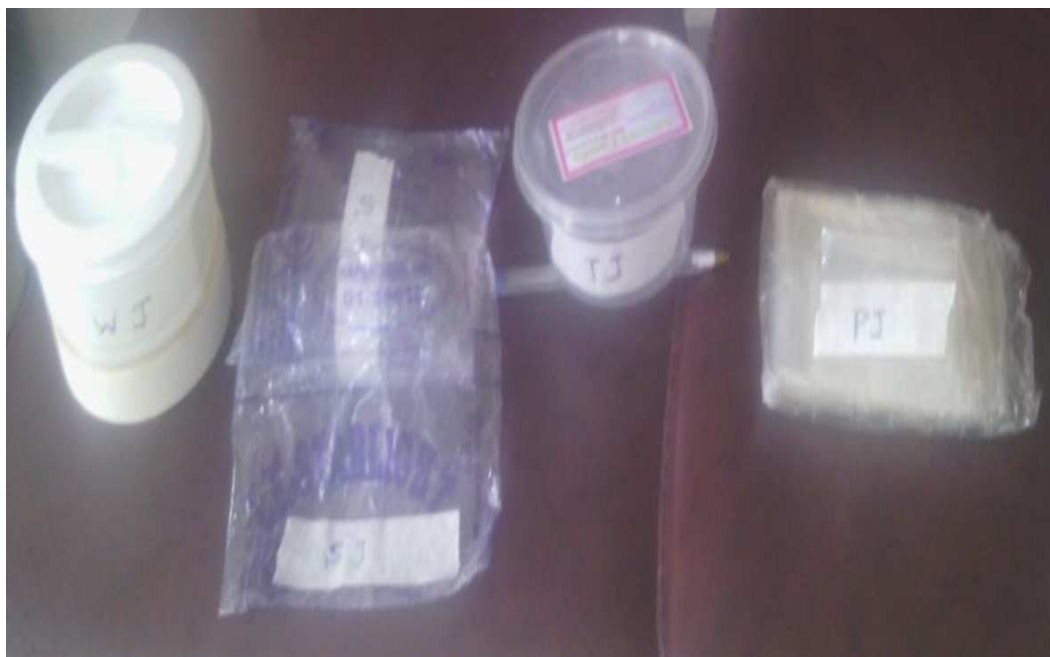
Figure 1. The different locally available containers used in the study. From left to right: WJ (white plastic plate with screw cover), SJ (sachet water package), TJ (transparent plastic plate with pull-press cover) , PJ (polythene pouch).

In Nigeria, these various packaging materials have not been utilized for local production of preserves for commercialization. A cursory survey of some retail markets revealed mainly the imported ones in glass jars. Thus, this work attempted to compare some quality parameters of mixed fruit Jam packed in different common packages in Nigeria, after a long storage period of 15 months.